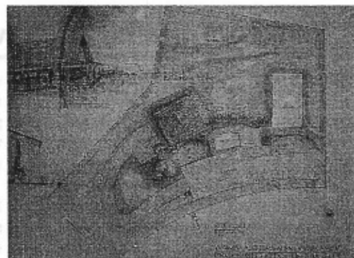
Layout of center with conceptualized kitchen building

into design and planning by the start of summer. It will house a certified kitchen and a larger computer room to expand the services of the Hawaiian Homestead Technology Program. Also housed in the new kitchen will be a new maintenance room to accommodate the necessities of operating and maintaining the fa-